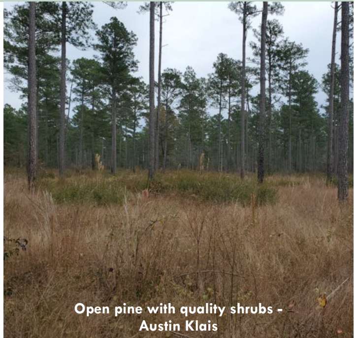
Open pine with quality shrubs - Austin Klais

Shortleaf pines thrive with prescribed fire, and young trees can resprout after fire if top-killed, increasing the ability to manage for an open understory at young ages.