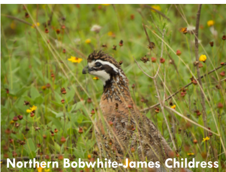
Northern Bobwhite-James Childress

Periodic thinning and prescribed fire maintains native grasses, wildflowers, and shrubs that encourage Northern Bobwhite Quail and Eastern Wild Turkey to move in and stay.