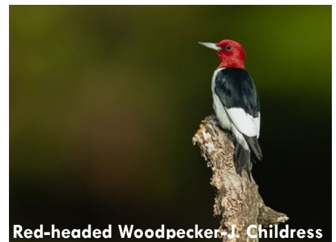
Red-headed Woodpecker-J. Childress