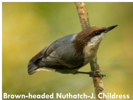
Brown-headed Nuthatch

Leaving a few standing dead trees is good for cavity nesters such as the Brown-headed Nuthatch and Red-headed Woodpecker shown at right.