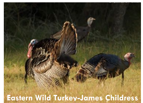
Eastern Wild Turkey-James Childress

Leaving a few standing dead trees is good for cavity nesters such as the Brown-headed Nuthatch and Red-headed Woodpecker shown at right.