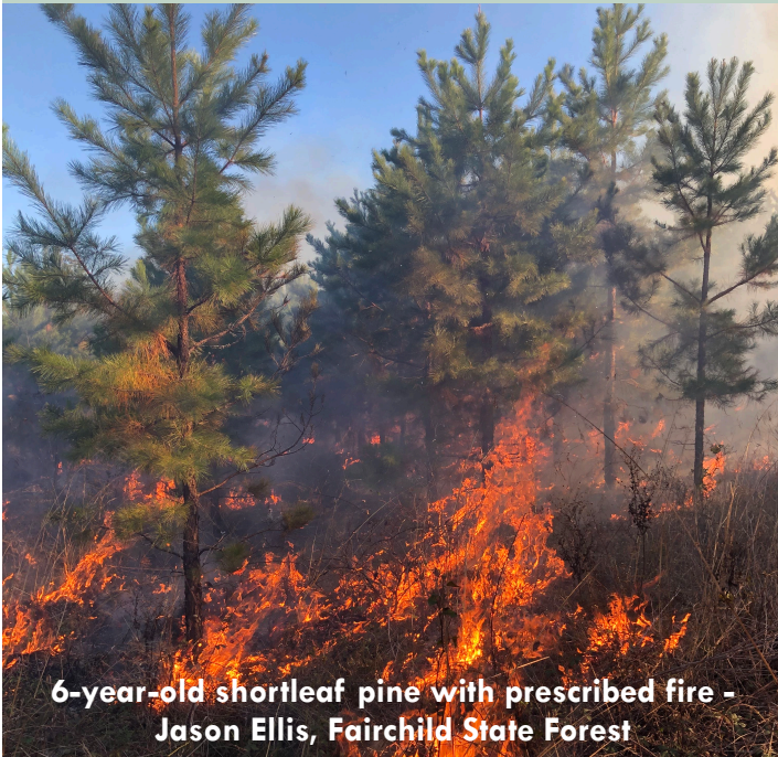
6-year-old shortleaf pine with prescribed fire - Jason Ellis, Fairchild State Forest

It is possible to manage your forestland for better habitat, increased wildlife, and more enjoyment!