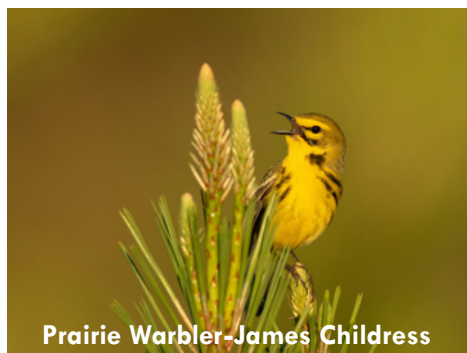
Prairie Warbler-James Childress